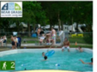
Green Acres Family Campground in Bear Grass Camping, swimming, fishing, golf, arts & crafts, bingo, volleyball, arcade and more