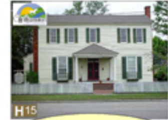
Asa Biggs House Williamston