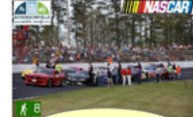
East Carolina Motor Speedway Robersonville