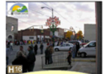
Williamston Historic Downtown Commercial District