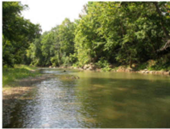
Map guide to the cultural, dining and recreation sites in Martin County.

Martin County was established on March 14, 1774. It was named for Josiah Martin, the last royal governor of NC (1771-1775). The county is approximately 461 square miles in area and as of the 2010 census the population was 24,505 persons. The county seat is Williamston. The Roanoke River runs along the boundary of the north side of the county.