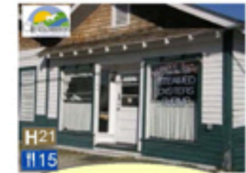
Sunny Side Oyster Bar Williamston