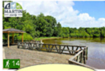
River Landing Boardwalk Williamston