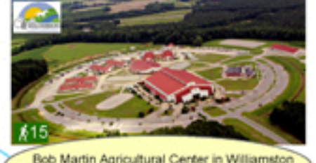
Bob Martin Agricultural Center in Williamston Rodeos, tractor pulls, horse shows and more