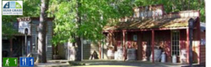
Deadwood Park in Bear Grass Mini golf, amusement rides, wild west show