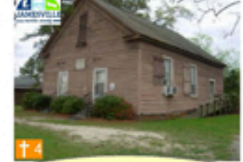
Jamesville Primitive Baptist Church Built 1865-1870