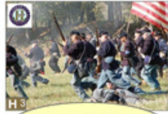
Fort Branch Civil War Site Hamilton