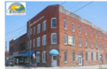
Martin County Arts Council Williamston