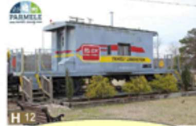
Family Lines System Train Caboose Parmele