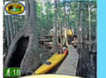
Roanoke River Paddle & Camping Trail