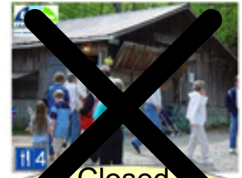
Crossed Grill Riverfront Restaurant Jamesville