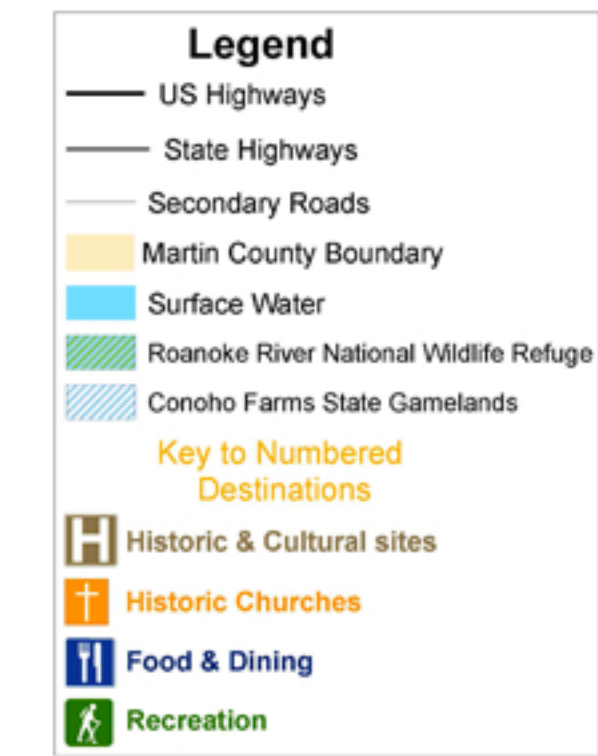
Map guide to the cultural, dining and recreation sites in Martin County.